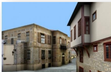
a. View of Kougioumtzoglou mansion, Old city of Xanthi, Greece