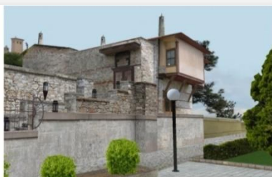
b. View of Mehmet Ali's house, Old city of Kavala, Greece