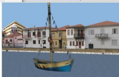
c. View of Saint Barbara's springs, Drama, Greece